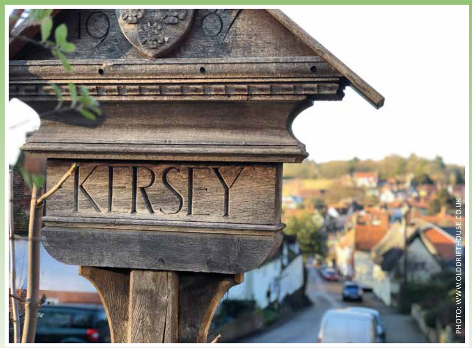
Kersey's unique village sign