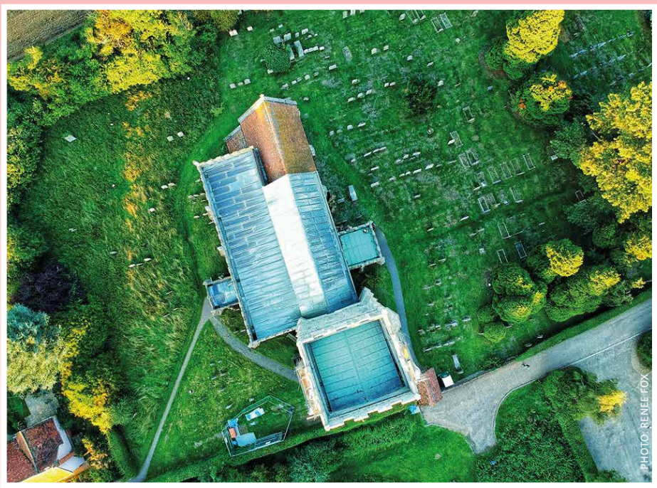
St Mary's from an unusual angle